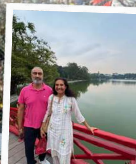
Hoan Kiem Lake