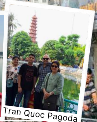
Tran Quoc Pagoda