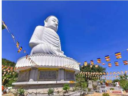
Linh Ung Pagoda